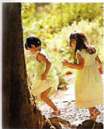
Flower girls (nieces of the bride and groom) wore green by Pulitzer dresses with pink trim to match the flowers.