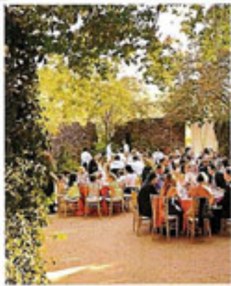
Stone walls, part of ruins at the Annadel 1880 Winery & Gardens, served as a romantic backdrop for dinner.