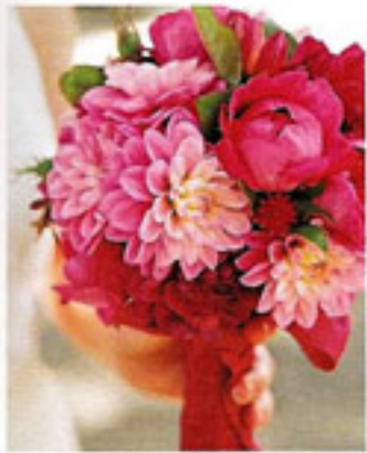
Florist Arne Appleman used bright pink dahlias and roses to get the fluffy look of peonies the bride initially wanted.