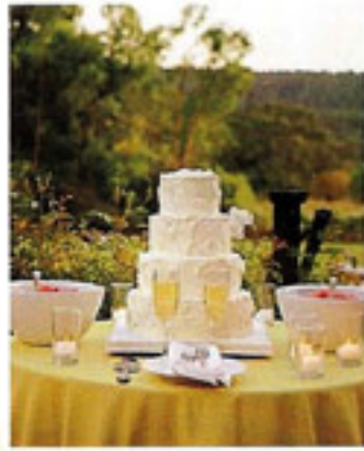
The chocolate cake was iced with a mix of buttercream and meringue. Big bowls of berries, for topping, sat alongside.