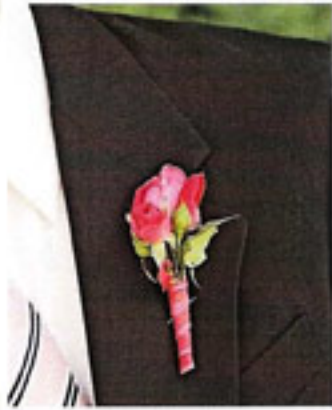
The groom's brother and the bride's stepfather wore pale pink ties, complementing the rosebud boutonnieres.