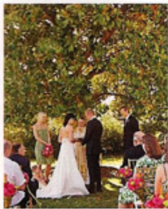
The ceremony, under a magnolia tree, was officiated by a friend's mother, who is an Episcopalian priest.