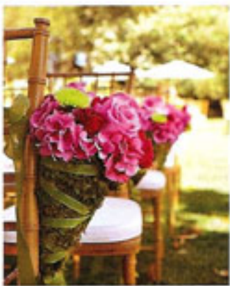
The bride's family vacations in Nantucket; the pink-and-green palette was a nod to her East Coast roots.