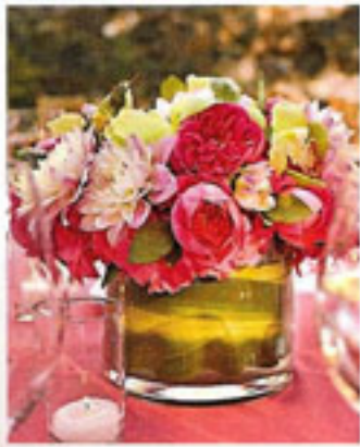
Flowers grown on the property are sold in local farmers' markets; here, centerpieces of roses, dahlias, and orchids.